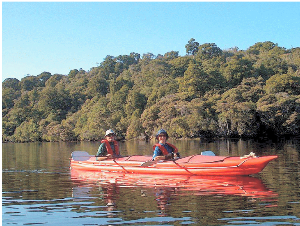
[Mk 6 K50D Pacific Double, Stewart Island New Zealand]